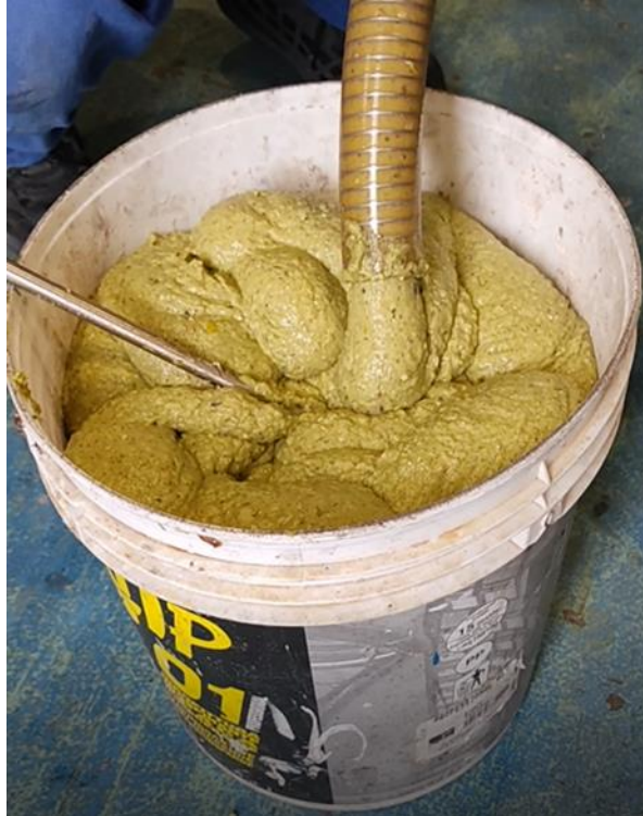
INTERMEDIATE STEP IN SILOS

The treatment allows a decidedly excellent final result, stable material, odorless, reduced in weight to 30% and in volume to 20% in accordance with the scientific analyzes carried out in the scientific experimentation phase.