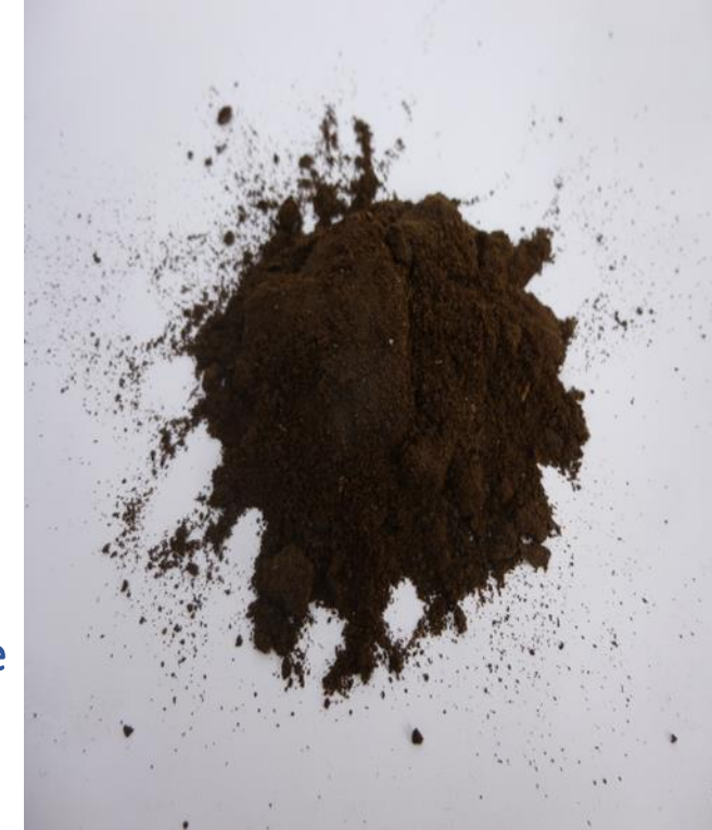
FINAL STEP AFTER SSH130

70% weight reduction 80% volume reduction